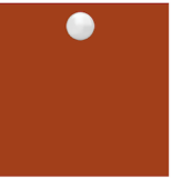
LITTLE GREEN HEAT