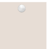
LICK WHITE 05